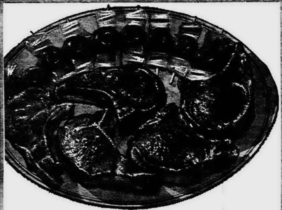
MEATY, LEAN RIB CENTER CUT