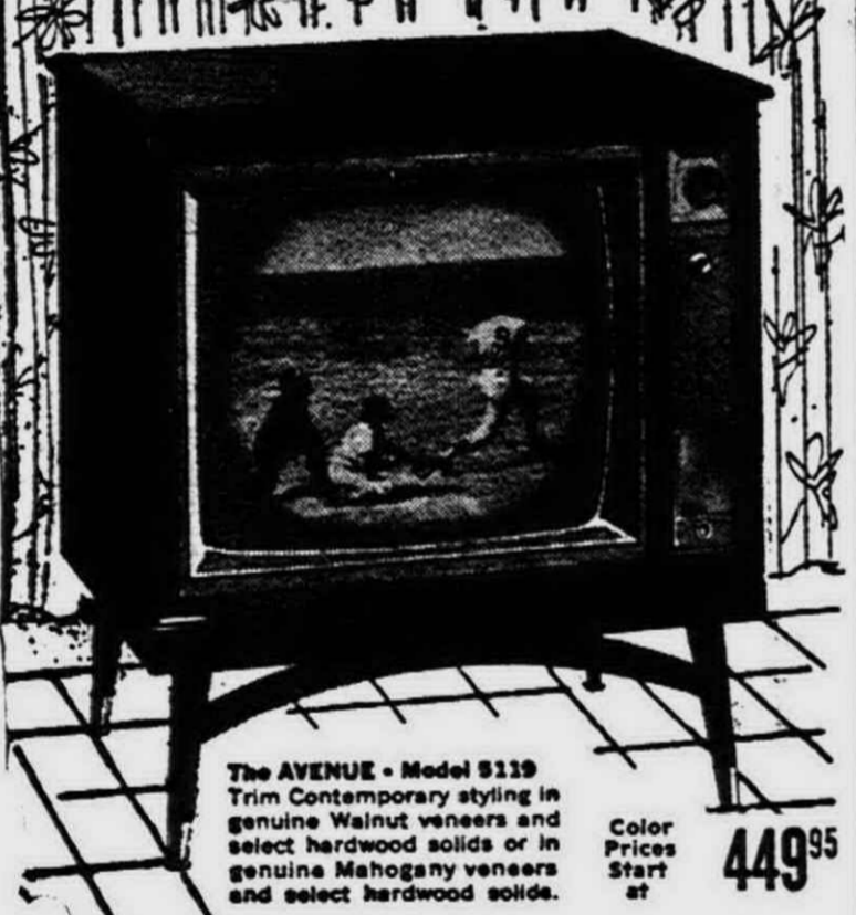
The AVENUE - Model 5119 Trim Contemporary styling in genuine Walnut veneers and select hardwood solids or in genuine Mahogany veneers and select hardwood solids. Color Prices Start at 449 95