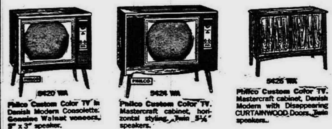
Philco Custom Color TV in Danish Modern Console. Genuine Walnut veneers. 5" x 3" speaker. Philco Custom Color TV. Mastercraft cabinet, horizontal styling. Twin 5 1/4" speakers. Philco Custom Color TV. Mastercraft cabinet, Danish Modern with Disappearing CURTAINWOOD Doors. Twin speakers.